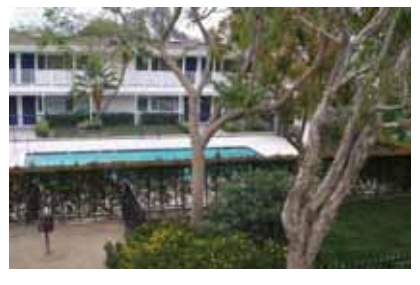
La Brezza exterior