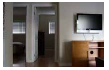
La Brezza interior